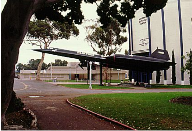
The “Blackbird”, SR-71, could fly at Mach 3, with a 2 man crew On view in the Forecourt of the San Diego Air & Space Museum